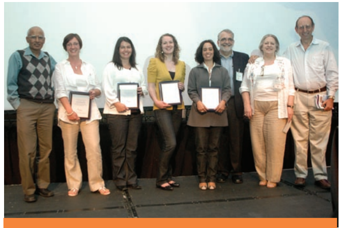
The Robert Austrian Lecturer Committee stands with the recipients of the prestigious research award in pneumococcal vaccinology.

consortium, which investigates the epidemiology of colonization by S. pneumoniae ; the pneumococcal vaccine project at PATH, which aims to accelerate development of safe, effective and affordable pneumococcal vaccines for children in the developing world; and The Mother's Gift Trial, which evaluates the effect of maternal immunization on infants' response to pneumococcal vaccine.