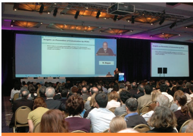
Participants rise early to attend a satellite symposium on new pneumococcal vaccines.

Ten years after the introduction of Pfizer's PCV7, Prevnar®, experts took advantage of the opportunity at ISPPD-7 to reflect on changes in the pneumococcal vaccine landscape since the last ISPPD, including the approval and introduction of the 10- and 13-valent PCVs. With expanded serotype coverage, these vaccines could have substantial impact in saving lives, especially in the developing world. They reviewed current research, which continued to evidence the general effectiveness of PCVs in reducing vaccine-type invasive pneumococcal disease (IPD) and nasopharyngeal carriage in children, as well as in indirectly decreasing the rate of invasive disease in adults, presumably through decreased transmission of pneumococcus from children to adults. Several plenary and poster sessions at the conference examined currently available PCVs, their roll-out in various countries, and the way forward for immunization practices using these technologies. Others shed light on the geographic diversity of serotype distributions, the approval process for PCVs, immunogenicity studies, and the potential impact of PCVs on mortality and morbidity due to pneumococcal disease.