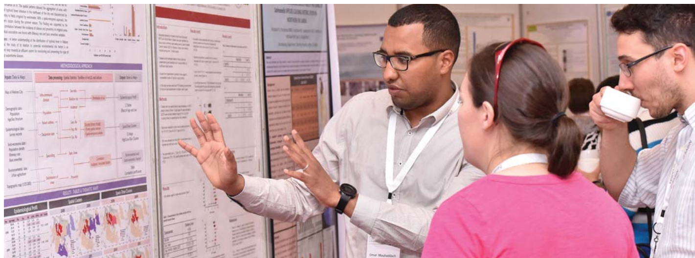
More than 250 researchers from 38 countries attended Sabin's 10th International Conference on Typhoid and Other Invasive Salmonellosis.

88% of respondents to a post-conference survey said they planned to implement techniques learned at the Coalition against Typhoid conference in their work.