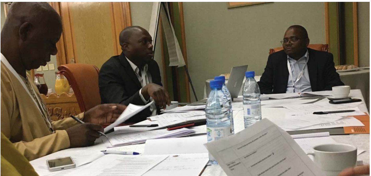
Workshop participants in Senegal discuss how to use economic evidence to increase sustainable funding for immunization.

Sabin's regional SIF senior program officers worked closely with their respective ministries of health and finance, as well as parliamentarians, to build political will and support for immunization. Sabin organized and led activities that encouraged stakeholders to share information and work together to determine the