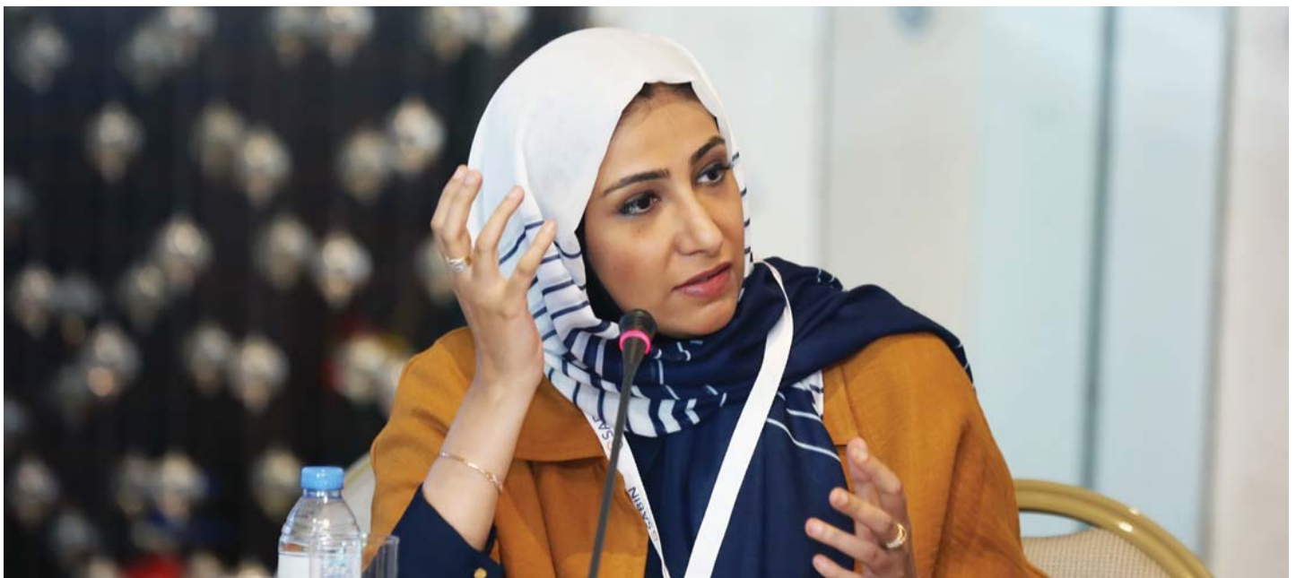
Health professionals from across the Middle East and North Africa discussed adolescent health and immunization.

Immunization plays a critical role in keeping preteens and teens healthy and protected from vaccine-preventable diseases, including influenza, whooping cough, tetanus, diphtheria, meningococcal disease and cancers caused by human papillomavirus. For various reasons, however, adolescents often do not receive recommended vaccinations. To better understand why this occurs and ultimately improve teen immunization rates, Sabin kicked off a series of three regional workshops in 2017 focused on promoting adolescent health and immunization. Health professionals from across the Middle East and North Africa attended the first two-day interactive workshop in Dubai, United Arab Emirates. By bringing together government health officials, adolescent health researchers and infectious disease scholars with immunization experts, the workshop helped participants identify tangible approaches they can take to achieve the promise of adolescent immunization. After all three regional workshops are held, Sabin plans to publish lessons learned so that those who could not participate can benefit from these important discussions. Improving adolescent health through immunization saves lives, and Sabin plans to continue with these workshops to ensure more adolescents receive appropriate vaccines.