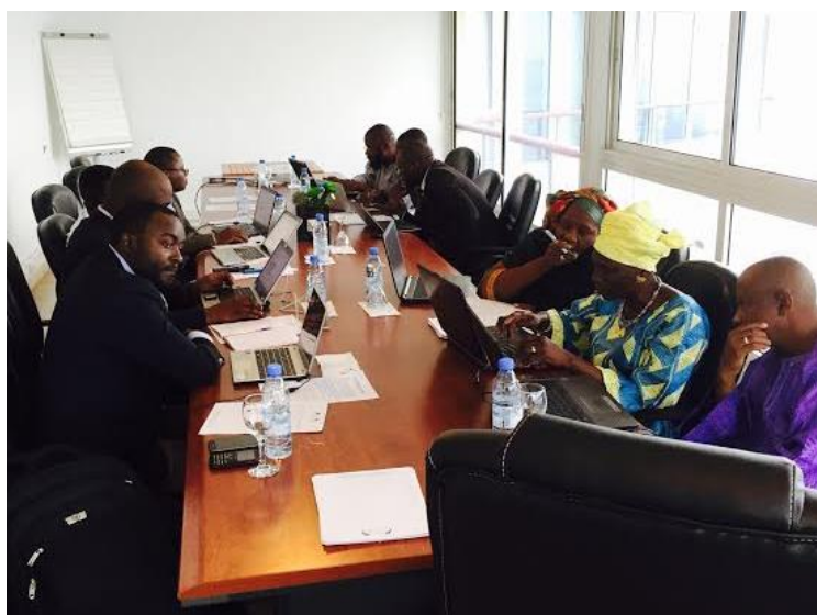
Above: The EPI delegates aggregate their data in preparation for a presentation on public financing trends.

Nine national immunization counterparts from Senegal, Mali, and Cameroon gathered at a Sabin-organized Peer Exchange Workshop on the Establishment of Resource Tracking Mechanisms for Immunization , in Dakar, Senegal on 19-20 June . The objectives were to cross-analyze budget tracking practices and to develop a common approach to monitoring immunization expenditures.